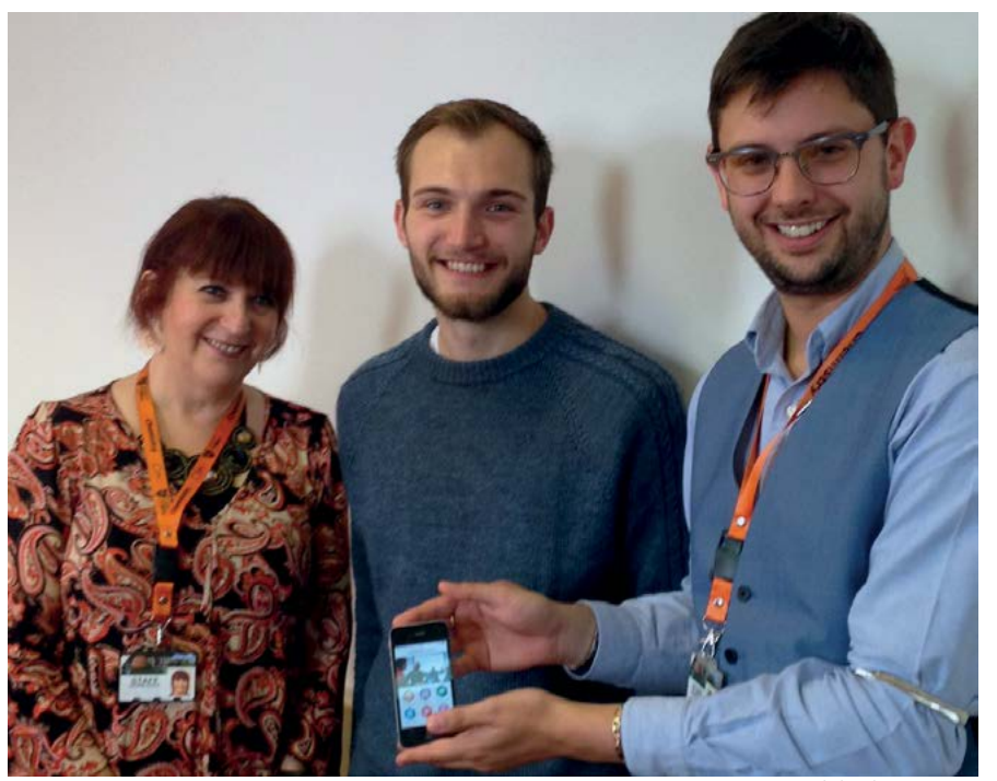
Some of the design team

'Working alongside the Department of Chemistry proved to be a rewarding experience for myself as I was able to successfully design and tailor a product to